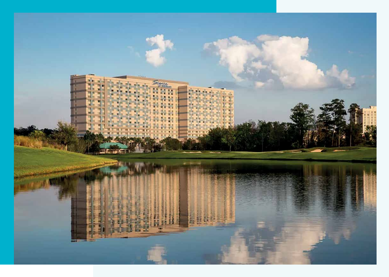
FSASC Annual Conference & Trade Show July 17-19, 2024

Signia by Hilton Orlando Bonnet Creek, Orlando, FL